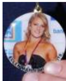
Ellen Maple Medal